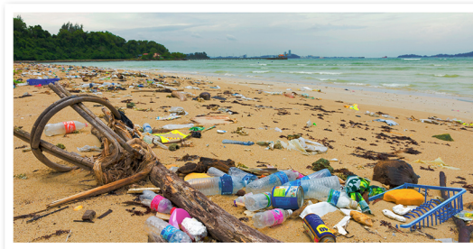
Plastic waste polluting the beach at Kota Kinabalu, Malaysia.

A lot of the waste that is thrown away goes into the world's seas and oceans. This is called pollution. Plastic waste takes a long time to break down and tiny parts of it will never go away. Plastic waste can be harmful to living things.